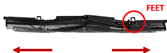
Extend the stretcher by pulling the handles outward.