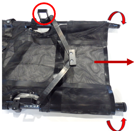
Unlock hinge by pushing toward end. Twist handles inward.