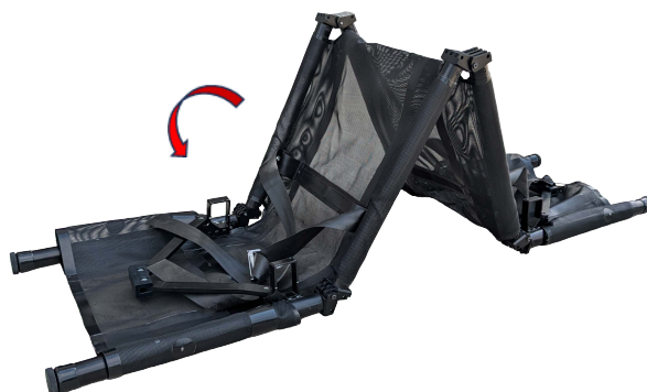
Raise center hinge.