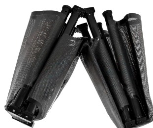
Ensure that the handles are pointing upward.