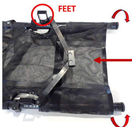
Secure the locking arm by pushing the center hinge into position. Now, flip the stretcher onto its feet.