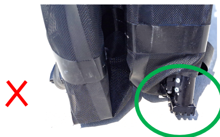
Fabric incorrectly hangs over hinge.